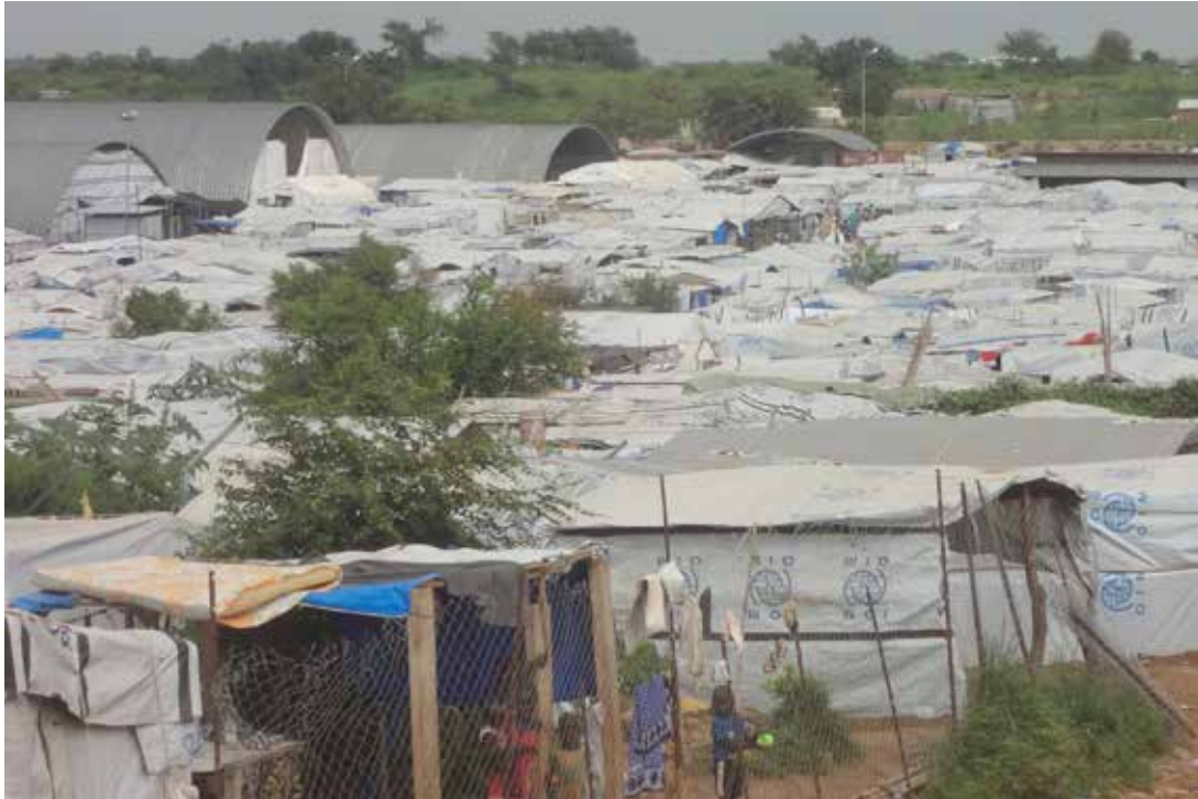
UNMISS PoC site in Juba, South Sudan. 2014

I tried to go to school here but found that I could not concentrate even on the easy things. They just opened a school here, but my thoughts distract me. When I sit still, my mind just goes to other things like my children.”