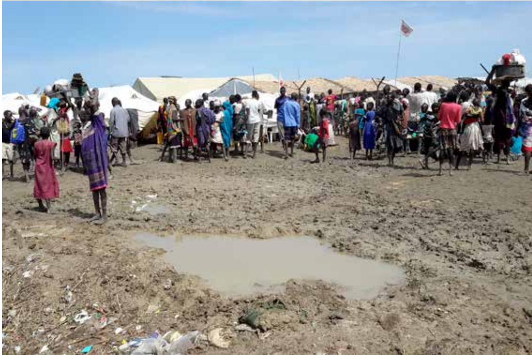
Newly arrived internally displaced people register at UNMISS PoC site in Bentiu, Unity state, May 2015.