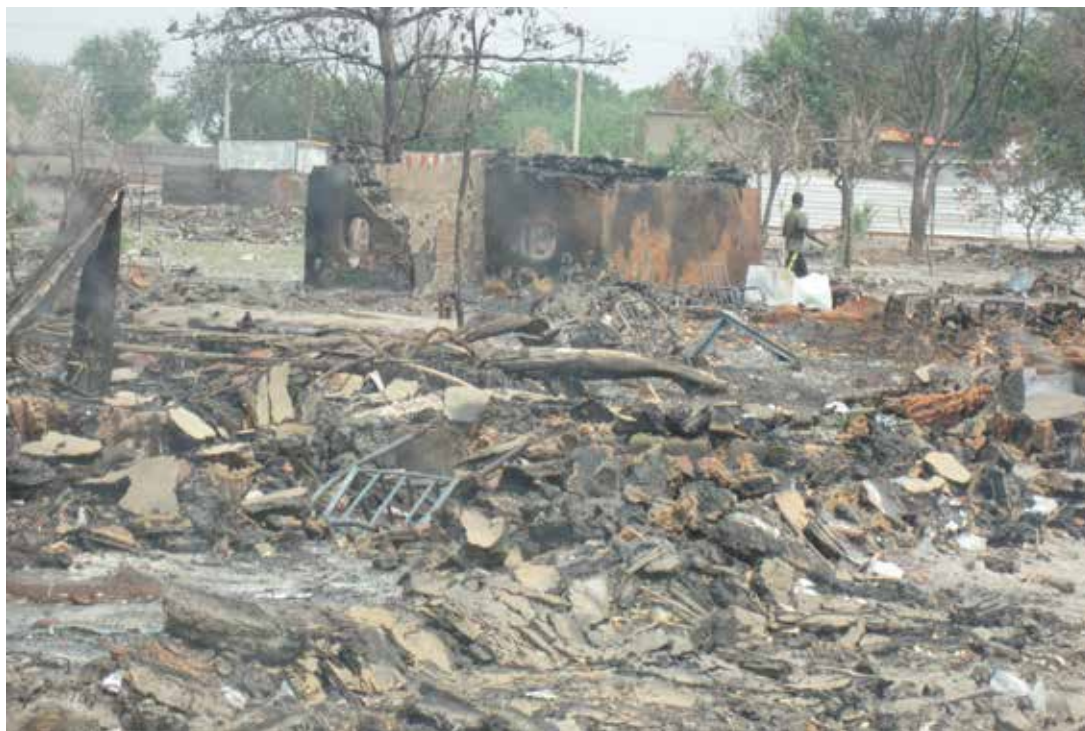
The conflict resulted in the destruction of homes, hospitals, and other buildings. Bentiu, South Sudan, March 2014.

In December 2013, growing political tension between President Salva Kiir and Dr Riek Machar mushroomed into a brutal internal armed conflict. 4 Fighting started in Juba, the capital, where government forces engaged in targeted killings, primarily of Nuer men. Security forces across the country split—with some maintaining allegiance to the government and others defecting to support the armed opposition under Machar, which came to be known as the Sudan People's Liberation Movement/Army-In Opposition (SPLM/A-IO). By the end of 2013, the conflict had engulfed parts of Jonglei, Unity, and Upper Nile states. 5