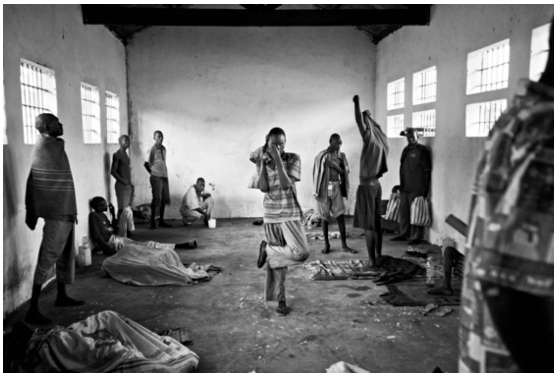
People with suspected mental conditions are routinely detained in prisons. Juba Central Prison, Juba, South Sudan, 2011.

The routine use of prisons to house individuals with mental health conditions is a stark manifestation of the inadequacy of mental health treatment, stigma about mental disorders and the deficit of facilities and trained staff. Individuals with mental health conditions deemed to pose a danger to themselves or others often end up arbitrarily detained in prison, even if they have not committed any crime. They may be transferred to prison from medical facilities or taken directly to prison by family members who feel unable to care for them. In May 2016, there were 66 male and 16 female inmates in Juba Central Prison categorized as mentally ill, more than half of whom had no criminal files. 92 According to a former health worker at Malakal Hospital, prior to the conflict, there were 27 people with mental health problems in the Malakal prison. “Some were brought to prison by family members because they were violent, aggressive, and suicidal,” he explained. 93