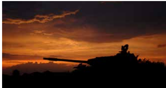
Cover photo: Military tank in Upper Nile state, South Sudan, 2009.