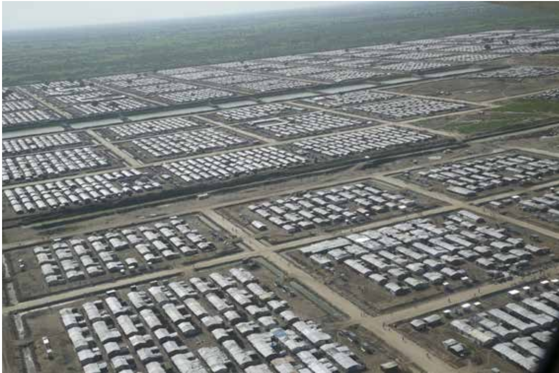
Aerial view of the UNMISS PoC site in Bentiu. June 2016.

Nyawal sought refuge in the Bentiu PoC site in early 2015, escaping an attack on her village in Guit county. She was raped by an SPLA soldier a few months after arriving at the PoC site when she ventured out to buy medicine.