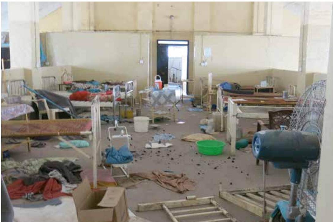
A ward in Malakal Teaching Hospital, where patients and displaced people who had taken refuge were killed by opposition forces in late February 2014. Malakal, Upper Nile state, March 2014.

“She can't manage—she's not normal. She can talk but it's senseless. She quarrels with the children. She cooks, but like a child, she burns things. She knows the children's names, but she does not know their ages. It is the children who tell her to do the things she should do. She can't identify what is happening...Sometimes I pray to God to help her.” 51