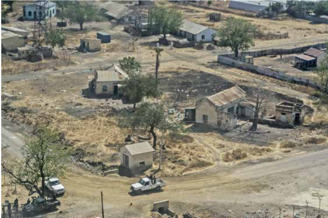
A view of the deserted streets in Malakal, Upper Nile state in January 2014 after residents fled violence between government and opposition forces.

Ajak fled to the Malakal UNMISS base on 25 December 2013, during the first attack on Malakal by opposition forces.