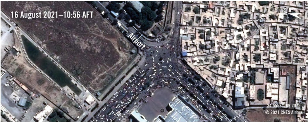
Kabul Airport vicinity. 16 August 2021.

In this report, Amnesty International, International Federation for Human Rights (FIDH) and the World Organisation against Torture (OMCT) have documented incidents of human rights violations that have taken place in Afghanistan since the takeover by the Taliban on 15 August. This report calls on the UN Human Rights Council (UNHRC) to take decisive action to establish a robust independent investigative mechanism to monitor and report on human rights abuses committed in violation of international human rights law, and to contribute to accountability for crimes under international law. Human rights defenders, journalists, and others who are targeted for their work must be evacuated and given safe passage if they wish to leave Afghanistan; and women and girls, and ethnic and religious minorities who are targeted because of their gender, ethnic, and religious identity, must be guaranteed protection. All those who wish to leave Afghanistan must be assured the right to seek asylum. At the same time, the Office of the Prosecutor of the International Criminal Court must receive assistance from the international community to immediately recommence its investigations into crimes under international law committed in Afghanistan.