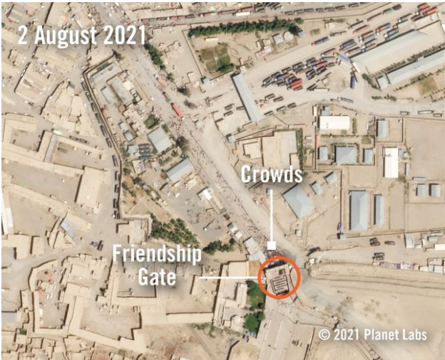
Spin Boldak border crossing. 2 August 2021.

Afghans who tried to cross land borders, an Afghan researcher, and the UN agency in charge of refugees (UNHCR), all told Amnesty International that the Afghan people were also prevented from seeking refuge abroad because most of the land border crossings were closed for asylum seekers. 185