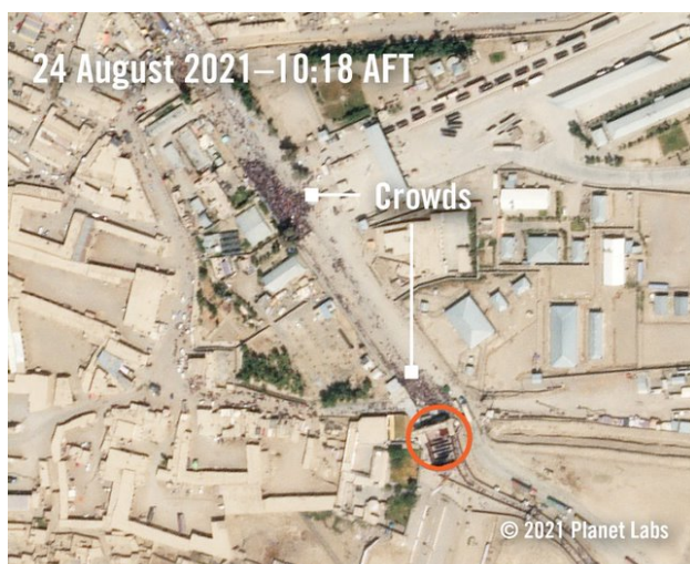
Spin Boldak-Chaman crossing. 24 August 2021.

For instance, according to UNHCR, Pakistan closed its border with Afghanistan, except for people in need of medical treatment, or with a proof of residency. 186 Despite that, at the Spin Boldak-Chaman border crossing in Kandahar, people with Tazkira (National ID Card) from Kandahar, Helmand, Zabul, and Uruzgan were allowed to cross the border. Between 2 August 2021 and 24 August 2021, the crowds attempting to cross the border to Pakistan via the Spin Boldak crossing increased exponentially, as documented via satellite imagery (see above) and video analysed by Amnesty International.