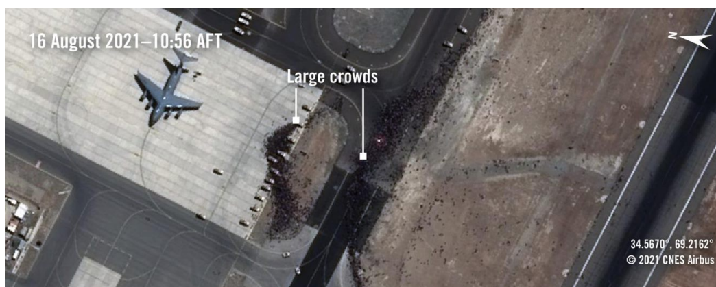
16 August 2021. Kabul Airport.

The thousands who are left behind, or are trying to leave Afghanistan, are testament to the brutal regime of the Taliban circa 2001, when extrajudicial executions abounded, and women and girls were oppressed with a plethora of restrictions. Since then, even in the last 20 years, the Taliban and other armed groups have conducted brutal attacks on civilians, journalists, human rights defenders, and government workers, resulting in Afghanistan having one of the highest civilian deaths in the world. 32 Nearly 50,000 civilians have died in the last 20 years. 33 The first half of 2021 alone recorded 5183 civilian casualties (1,659 deaths and 3,524 injuries), of which 32 per cent were children. This is a 47 per cent increase in civilian casualties compared to the same period in 2020. 34 Those responsible for these casualties include both anti-government and pro-government forces. 35